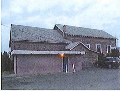
2704 East Kelowna Road- East Kelowna Community Hall $5,000 (new roof)