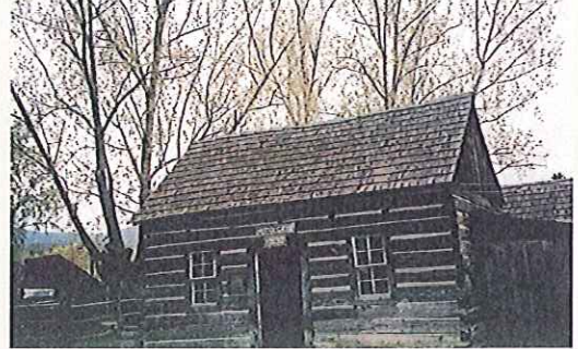
3685 Benvoulin Road Father Pandosy Mission McDougall House $3,000 (new roof)