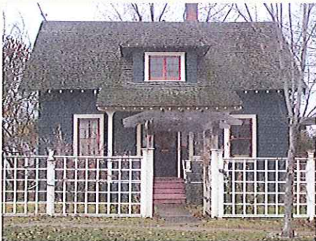
429 Park Avenue $4,800 (new roof)